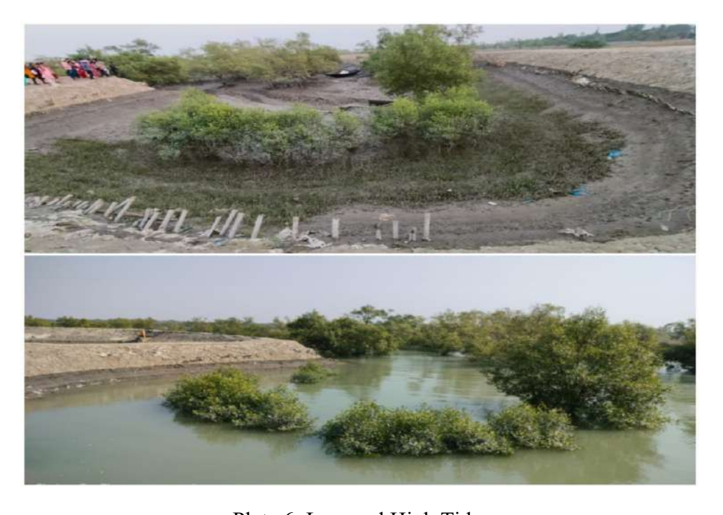
Plate 6: Low and High Tide