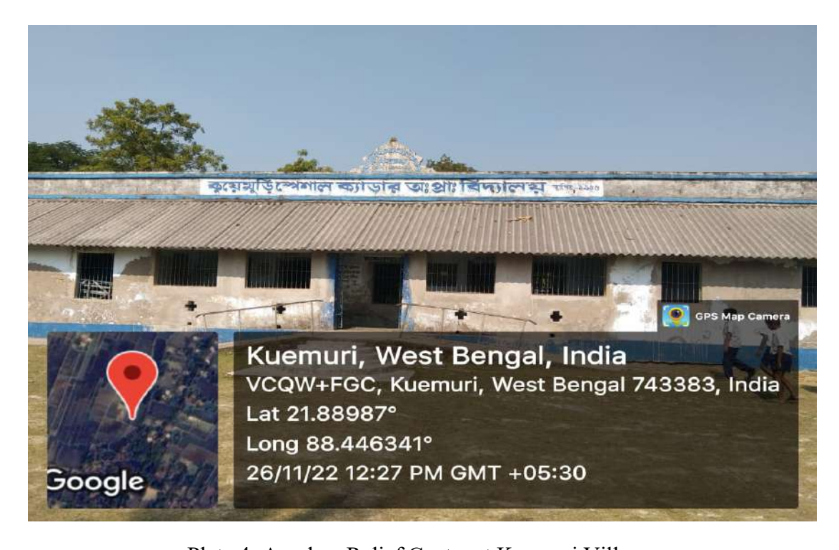
Plate 4: Amphan Relief Centre at Kuemuri Village