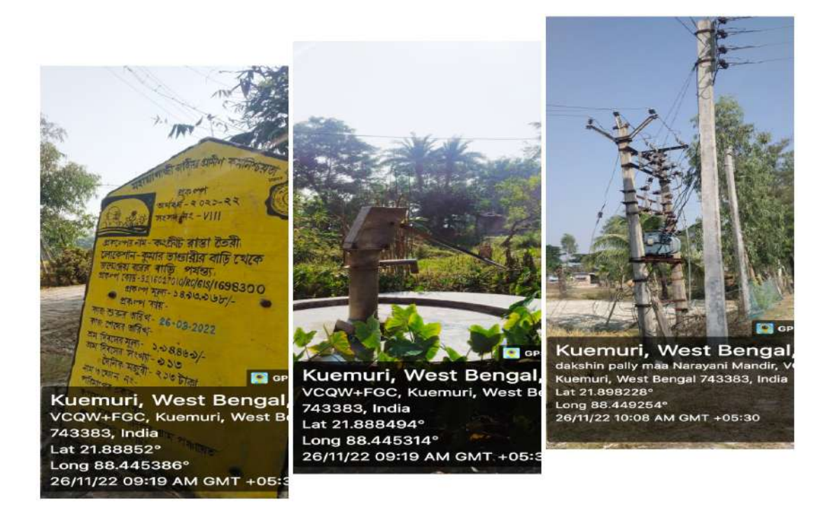
Plate 3: Condition of Road, Water & Eletricity at Kuemuri Village