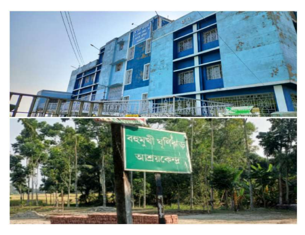
Plate 5: Primary School in Kuemuri Village