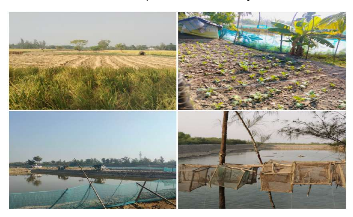
Plate 2: Crop Cultivation in Kuemuri

(Top leftt: Dudheswar Paddy, Top right: Vegetable, Buttom right: Crab Collection & Bottom left: Pisciculture)