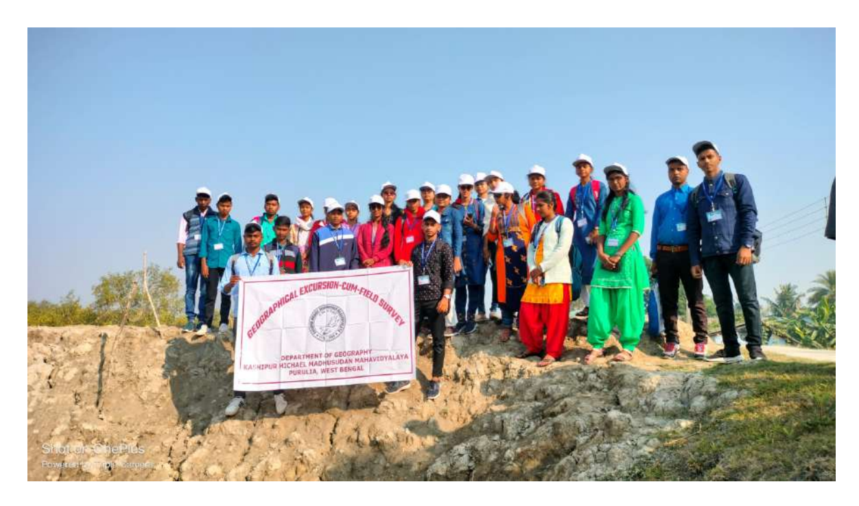
Plate 1: The Survey Team at Kuemuri Village, 2022